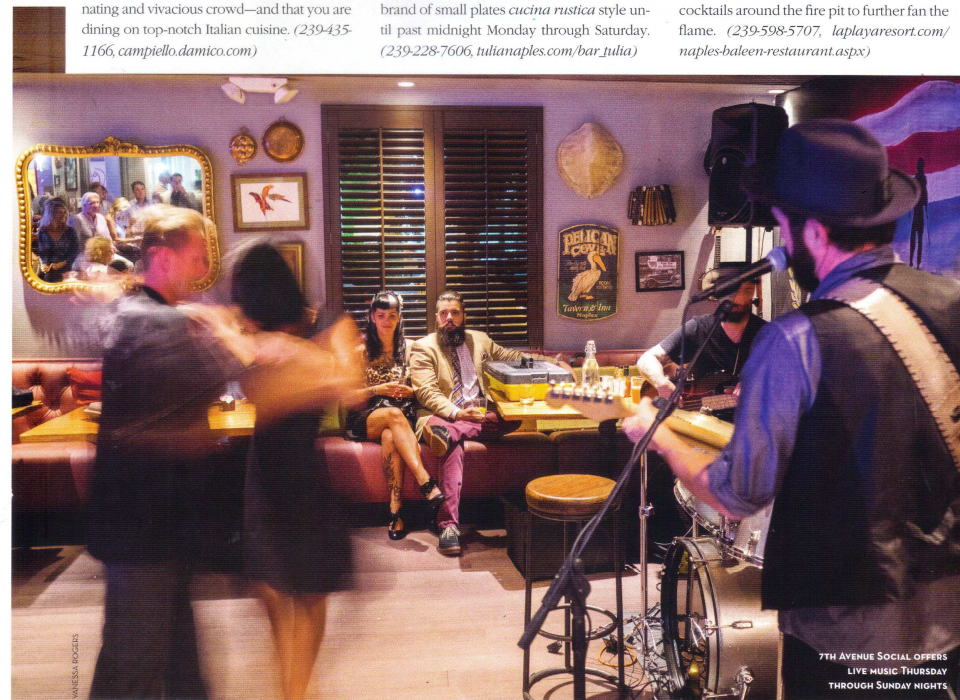
7TH AVENUE SOCIAL OFFERS LIVE MUSIC THURSDAY THROUGH SUNDAY NIGHTS

Torch-lit alfresco dining ignites passion on the beach at Baleen. After dinner, enjoy cocktails around the fire pit to further fan the flame. (239-598-5707, laplayaresort.com/naples-baleen-restaurant.aspx )